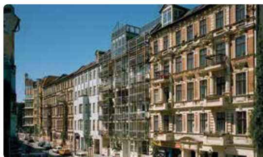
IBA Berlin 1987