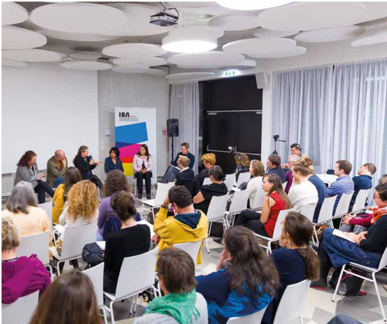
IBA-Talk entitled „Teenagers wanted! Children and teenager compatible planning and building“

Depending on the projects and the way the discussions develop it may be necessary to create further formats (e.g. project calls but also symposia etc.).