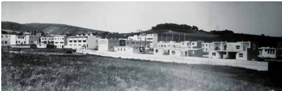
Werkbundsiedlung Vienna, 1932

In Germany a series of international building exhibitions took place at irregular intervals and with several, very different thematic focuses. Common to all of them is that they reflect their time in terms of social, technical and cultural tendencies and developments. Against the background of the Vienna_IBA "New Social Housing" it seems worthwhile to take a look back in history and to highlight above all those building exhibitions which, in both a narrower and broader sense, undertook an examination of the housing question.