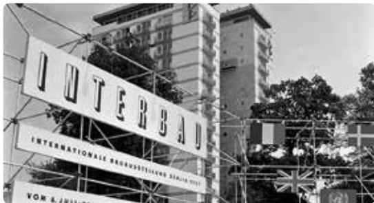
Interbau Berlin 1957

Berlin, 50 years later. Following the division of city urban development began to follow different paths in the western and eastern halves. Whereas East Berlin became the capital of the GDR, West Berlin, which was isolated, developed into a “propaganda” demonstration project of the West. With the support of the Marshall Plan in the 1950s a change from repairing to reconstructing the city was introduced. The dream was to create an articulated and more open city. A clean break was to be made with the traditional city and its 19th century tenement buildings.