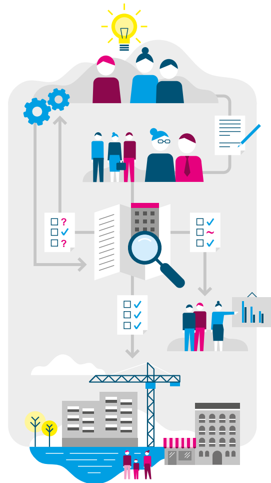
Graphics depicting the process leading to an IBA project

Such projects can provide a valuable basis at the research level and can offer new knowledge for future developments or they can be suitable learning or demonstration projects that serve as a springboard for innovative further developments. Depending on the theme and direction this can also apply to projects that are already running or that have recently been concluded.