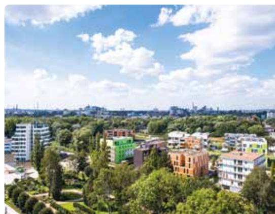
IBA Hamburg 2013

creasingly international develop its strength and how can social and cultural barriers be overcome through a holistic approach to planning using the means of urban planning and architecture as well as education, culture and the promotion of local economies?" With concrete building projects as well as social and cultural programmes new urban spaces for the international urban society of the 21st century were developed, without any obligation to mix but with the possibility of building bridges. 3 For the first time in the history of building exhibitions the future of living together in the metropolis became the focus of an International Building Exhibition.