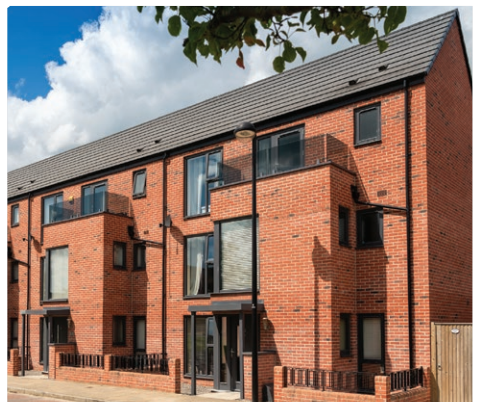
Allerton Bywater